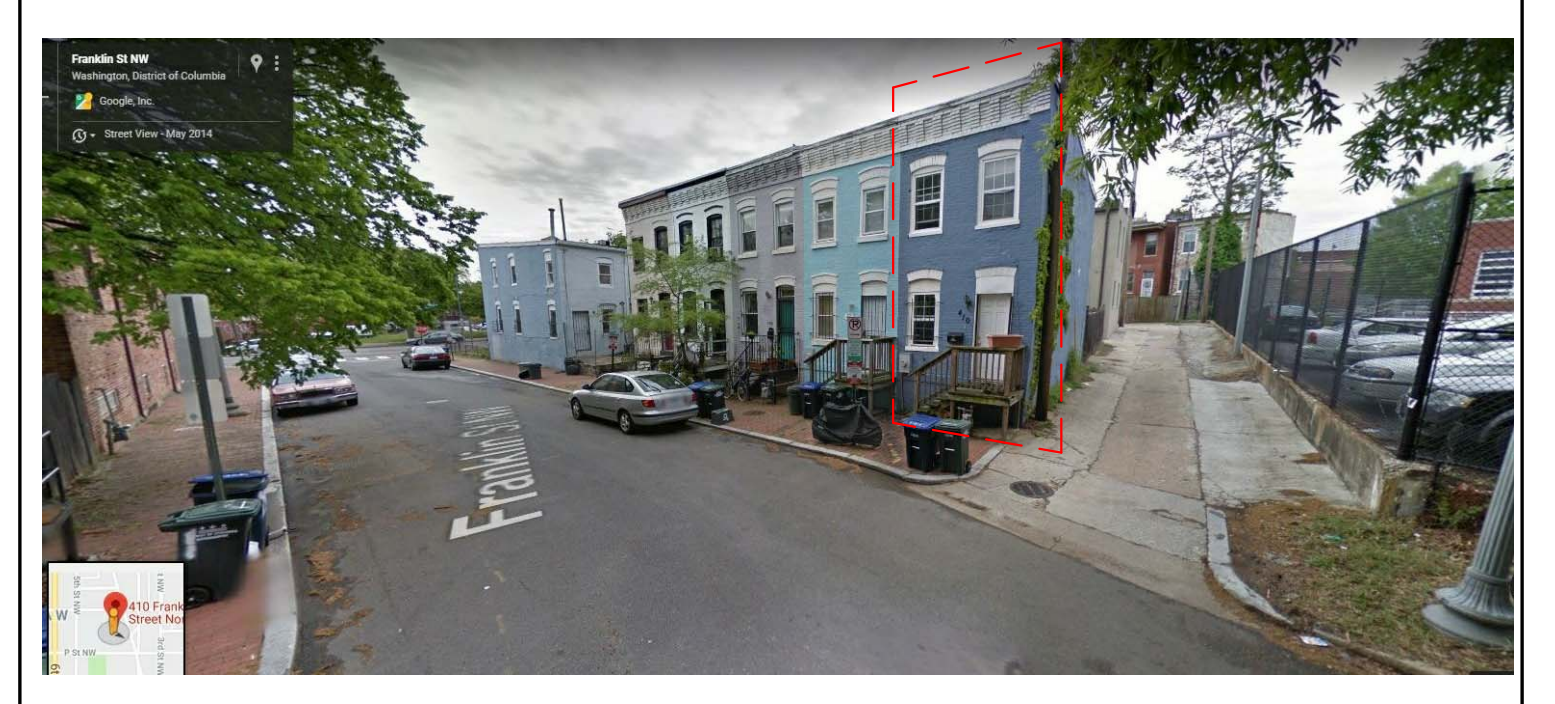
LOOKING NORTH ON FRANKLIN STREET-TOWARDS NEW JERSEY AVE.