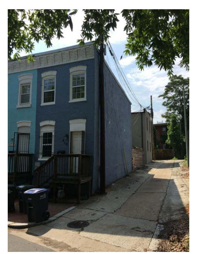
EXISTING ALLEY FACADE