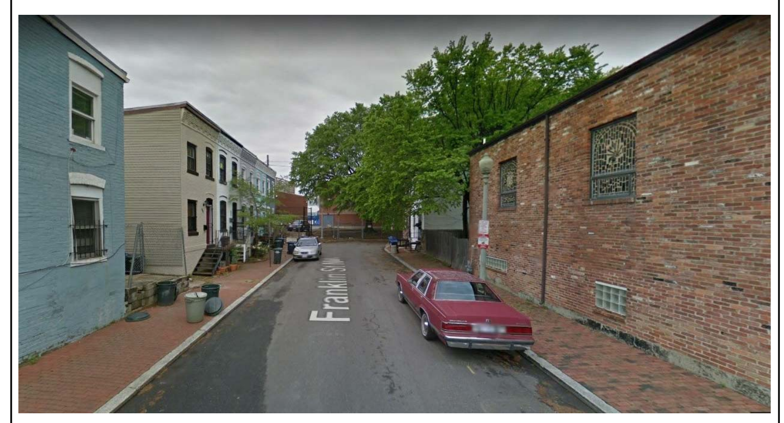
LOOKING SOUTH ON FRANKLIN STREET - FROM NEW JERSEY AVENUE