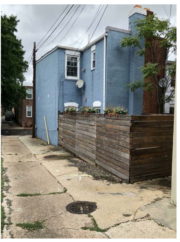
VIEW FROM ALLEY AND REAR YARD SHOWING THE EXISTING DOGLEG